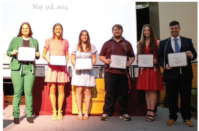
2024 Chi Sigma Mu Honor Society Inductees