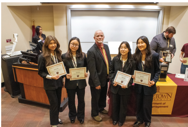
3rd place winners from Bergen County Academy