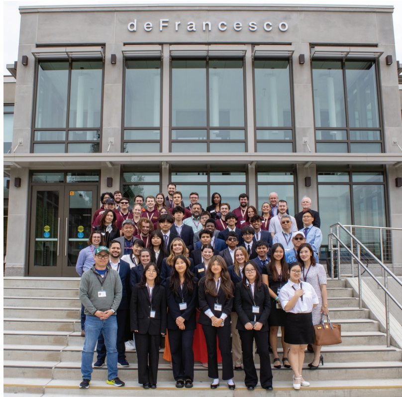
High school students, judges, professors and volunteers

On April 16 and 17, the Sport Management department hosted the second annual National High School Sport Business Case Competition, where eight high school finalists competed at the de Francesco building.