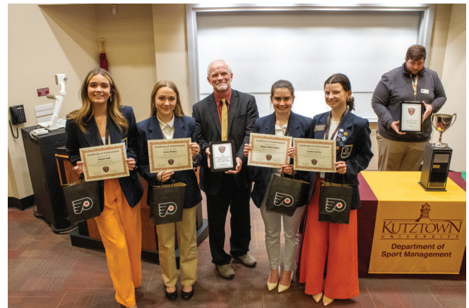
2nd place winners from Eastern York High School