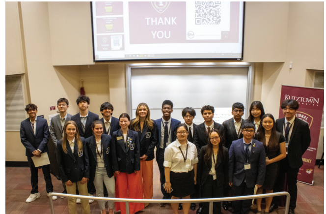
All the winners from the competition