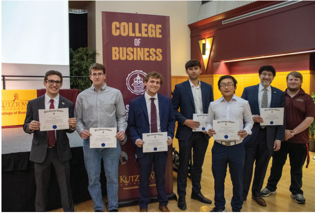
Beta Gamma Sigma Honor Society inductees